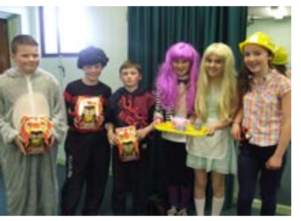
Pictured are Year 8 pupils who won prizes for World Book Day.