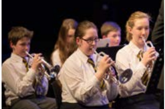
Membersof the Junior Brass Band.