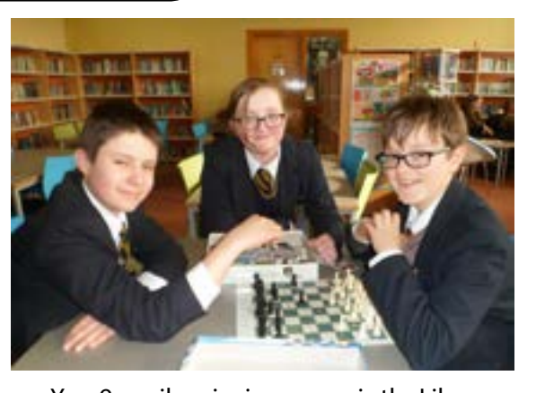
Year 9 pupils enjoying games in the Library