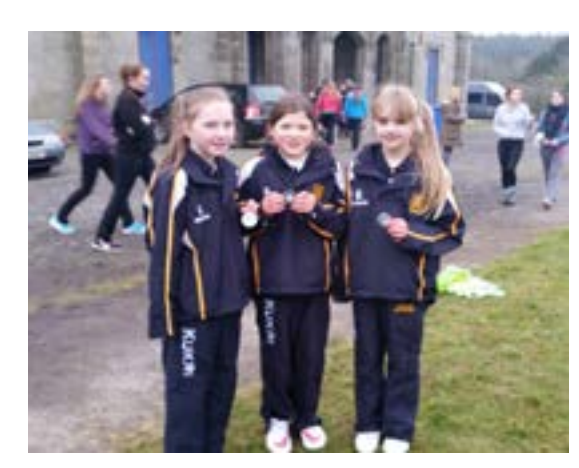
Mini Girls 1st, 2nd and 3rd