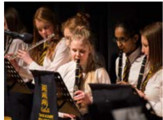
The Jazz Group