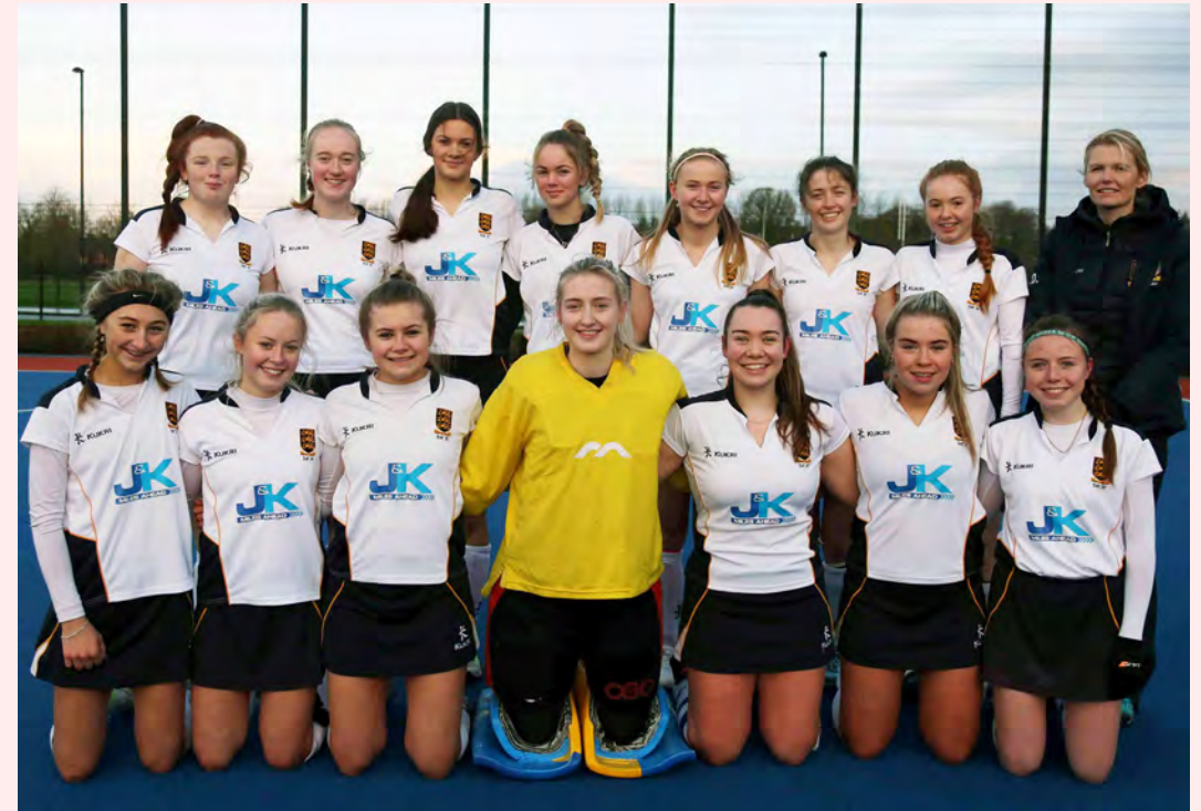
ALL PUPILS, FROM BEGINNER TO PROFICIENT, ARE ENCOURAGED TO PARTICIPATE IN A SPORT AFTER SCHOOL.